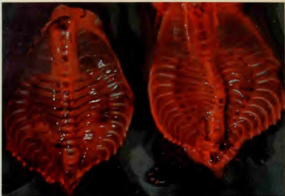
Fig. 7. Rickets in kits — spinal column: L , normal; R , twisted due to rickets.